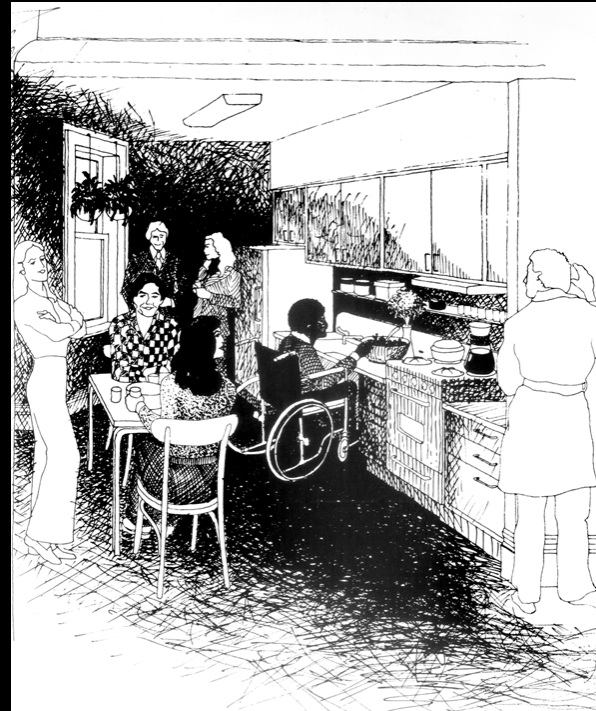
Removal of barriers to disabled persons